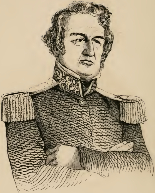
COL J. J. ABERT